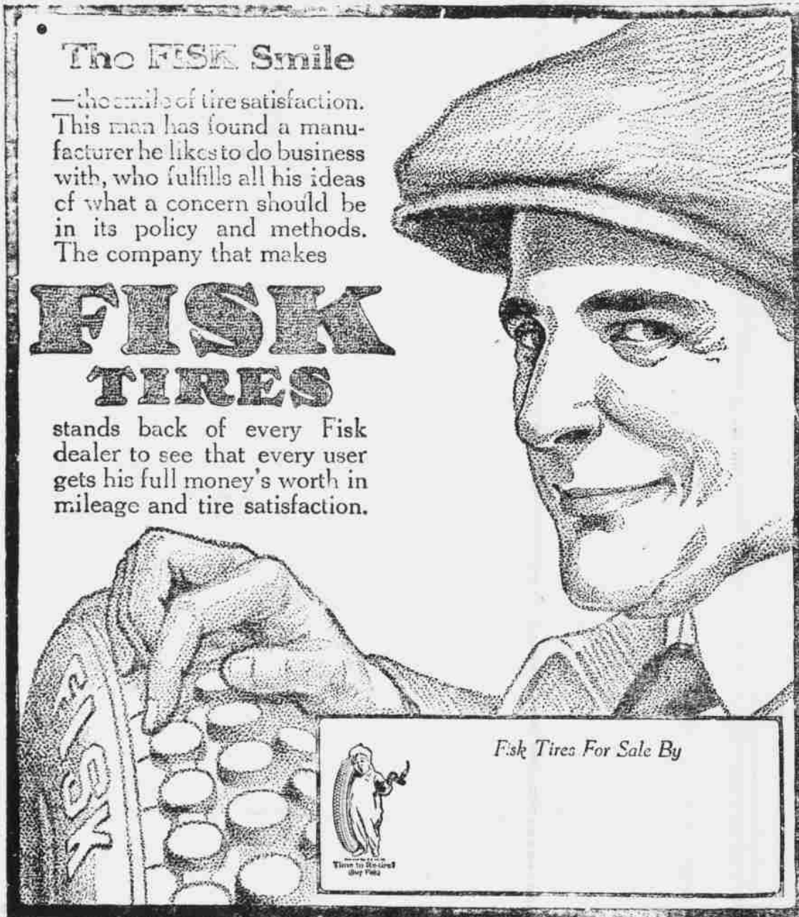
Fisk Tires For Sale By

stands back of every Fisk dealer to see that every user gets his full money's worth in mileage and tire satisfaction.