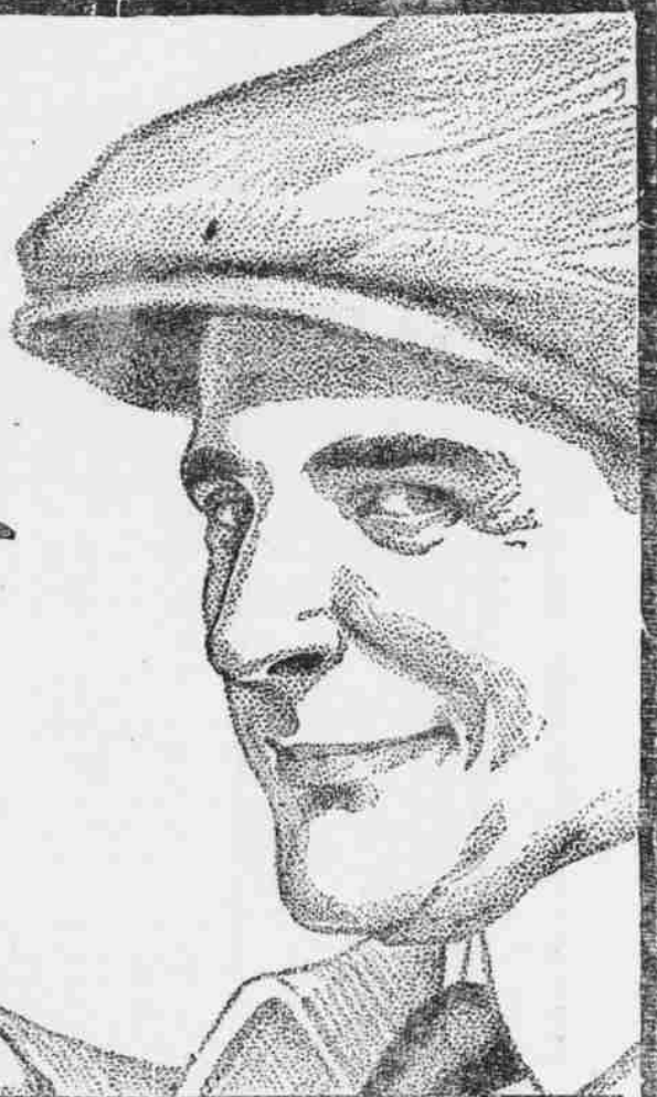
Fisk Tires For Sale By

stands back of every Fisk dealer to see that every user gets his full money's worth in mileage and tire satisfaction.