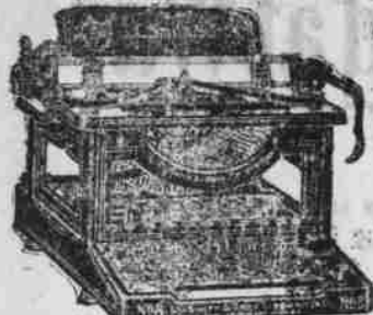
Ball Bearings Long Wearing

—Model 8 shows what should now be expected of a typewriter.