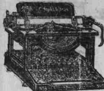
Ball Bearing; Long Wearing

—Model 8 shows what should now be expected of a typewriter.