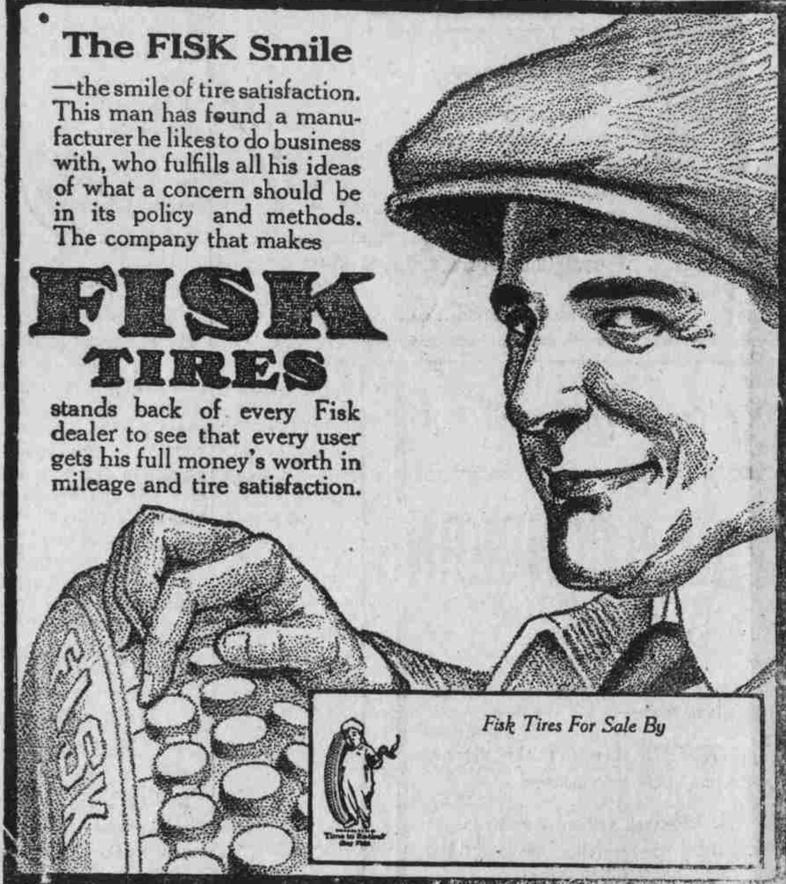
Fisk Tires For Sale By

stands back of every Fisk dealer to see that every user gets his full money's worth in mileage and tire satisfaction.