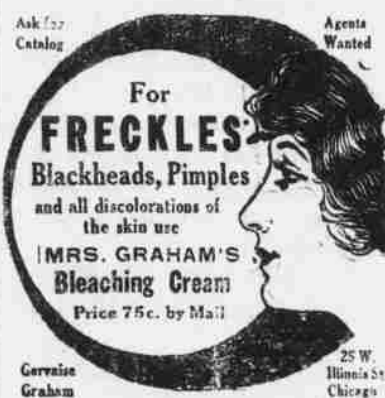
25 W. Illinois St. Chicago

You will find examples of our unequalled values in our Kirschbaum Specials at $15, $20, $25—the greatest clothes values in America.