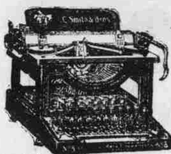
Ball Bearing; Long Wearing

—Model 8 shows what should now be expected of a typewriter.