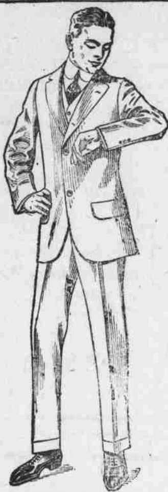
Copyright, 1913, A. D. Kirschbaum Co.

Kirschbaum Clothes $15 $20 $25 The Greatest Clothes Values in America