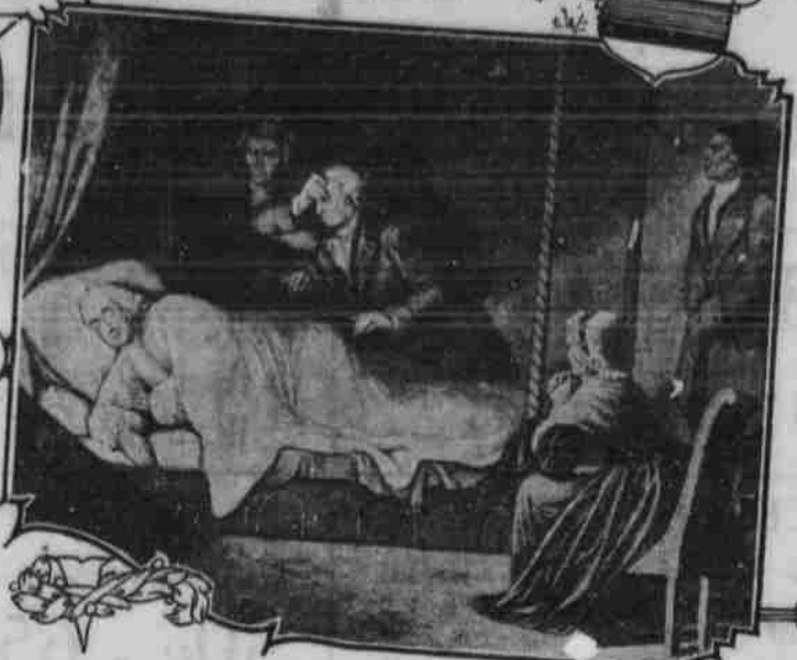
PAINTING DEPICTING LAST MOMENTS OF WASHINGTON