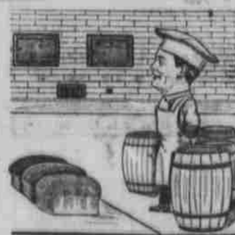
Table Supplied With Best The Market Affords

A LIGHT AND FRESH LOAF with a crispy top to it. We accomplish that result with the assistance of the most modern ovens, just the right heat and the right flour. Not forgetting that our bakers understand their business. We get the same result with our cake, too.