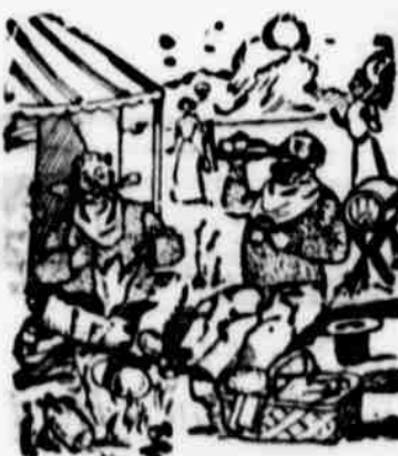
A Picnic for Two.