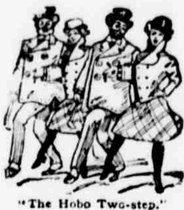
"The Hobo Two-step."