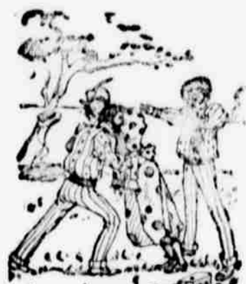
"This is so Sudden."