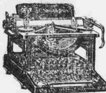
Ball Bearings—Long Wearing

—Model 8 shows what should now be expected of a typewriter.