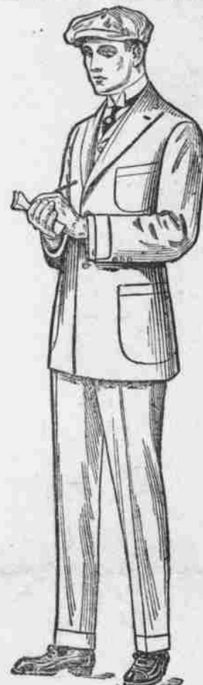
Copyright, 1913, A. B. Kirschbaum Co.

Kirschbaum Clothes $15. $20 $25 The Greatest Clothes Values in America