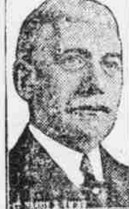
Hon. Elihu Root

The question of Woman Suffrage is an issue before the American people. Twelve states have adopted it, four more states vote upon it this fall and it is strongly urged that it become a platform demand of the national political parties. It is therefore the privilege and the duty of every voter to study carefully this subject. Hon. Elihu Root, in discussing this question before the Constitutional Convention of New York, recently said in part: