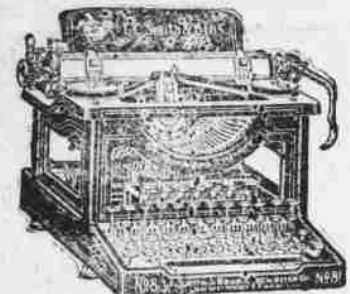
Ball Bearings Long Wearing

—Model 8 shows what should now be expected of a typewriter.