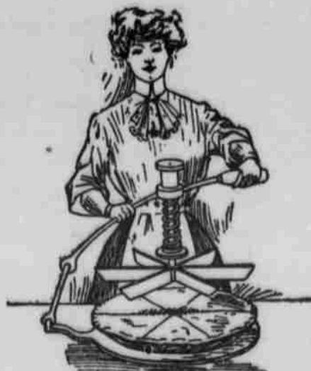
Six Pieces at one Cut.

A pie-cutting device, which cuts a whole pie into six pieces at one operation, has been designed for the use of hotels and restaurants. It consists