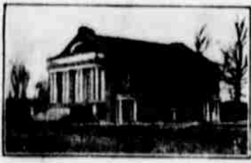
TOWN HOUSE, GOSHEN, MASS.