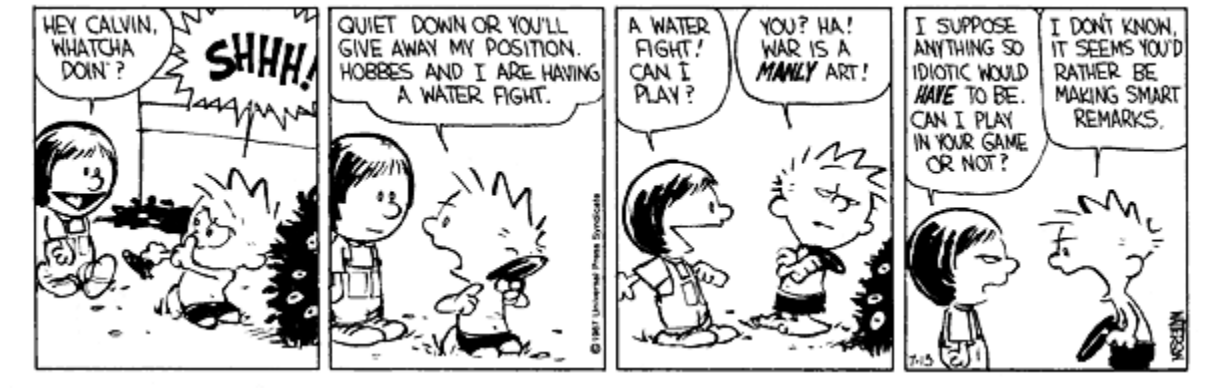
Fig. 2: Calvin & Hobbes by Bill Watterson

much against the will.” If Sid can find peace in the world, either in the West or Midwest, Eden and her femininity must be a part of it, and that is why rendering her character needs a delicate authorial touch. I believe it was Calvin from Calvin & Hobbes who once said, “War is a manly art.”