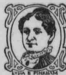
LYDIA E. PINKHAM