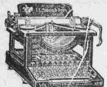
Ball Bearing; Long Wearing

—Model 8 shows what should now be expected of a typewriter.