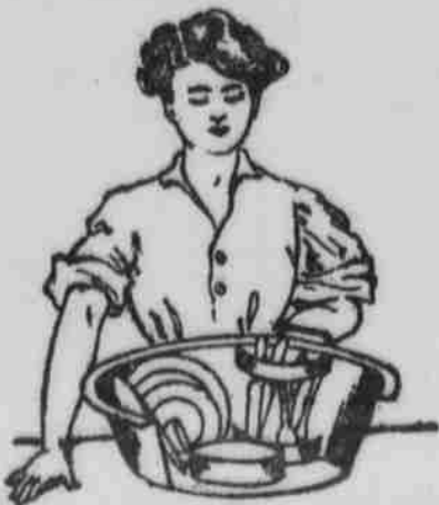
Dishpan in Operation.

A dish pan that serves the double purpose of a receptacle in which to wash dishes and one in which to keep them has been designed by a California woman. In the bottom of the pan, in the center, is a ring-like abutment. Along one side are top and bottom curved bends in which knives, forks and spoons can be stood upright and kept separate from the other contents of the pan. With the ring in the center, dishes are stood up around the sides, which makes them easier to wash and does away with the necessity of the washer having her hands always immersed in the hot, soapy water. Furthermore, the invention takes the place of a cupboard in families where only a few dishes are