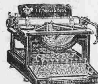
Ball Bearing; Long Wearing

—Model 8 shows what should now be expected of a typewriter.