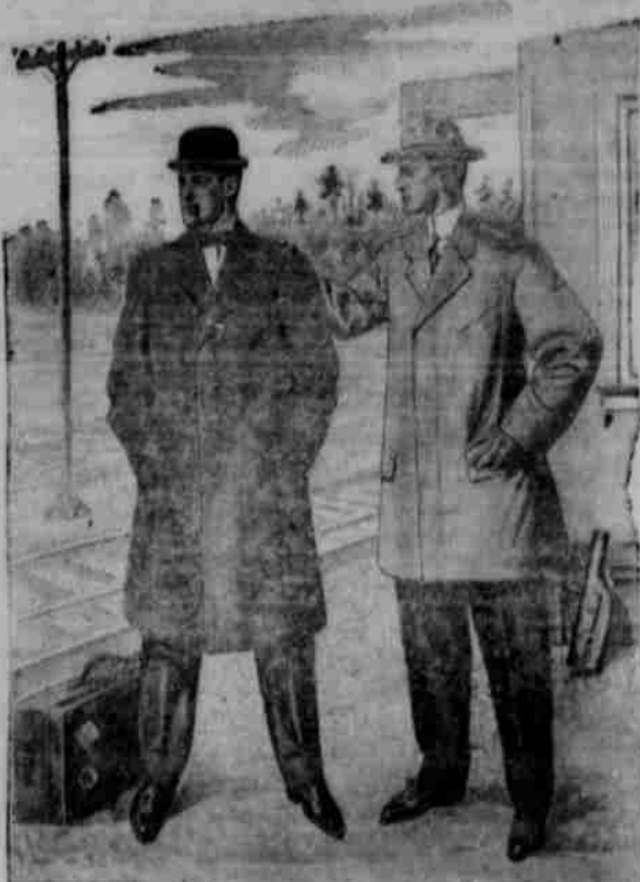
Sincerity Clothes Copyright

OUR GREAT CLOTHING SALE is the biggest money-saving event of the season. Right now, at Christmas time, when you must make your money go farthest, we give you the chance. Whether you need something for yourself, or a present for a friend the best selections and most attractive prices are brought out by our GREAT YEAR END SALE.