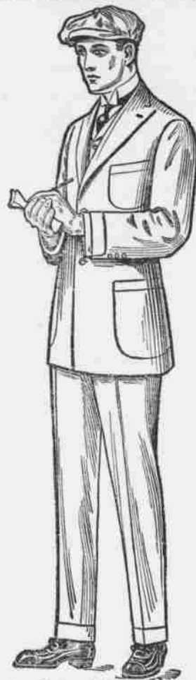
Copyright, 1913, A. B. Kirschbaum Co.

Kirschbaum Clothes $15. $20. $25 The Greatest Clothes Values in America