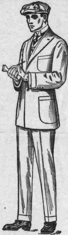
Copyright, 1913, A. B. Kirschbaum Co.

Kirschbaum Clothes $15 • $20 • $25 The Greatest Clothes Values in America