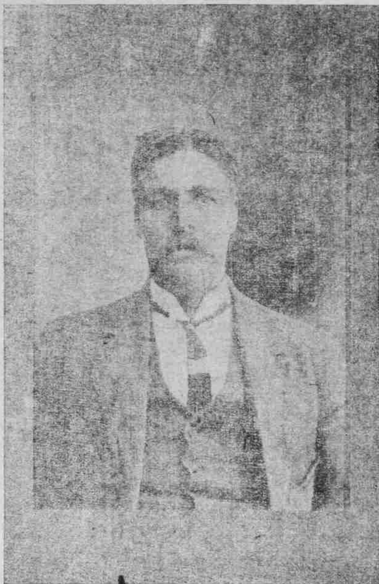
HON. SATURNINO BACA.