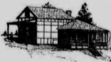
Fire and Waterproof.

Many houses are now being built in different part of Australia of asbestos material, says Popular Mechanics. The material is made in sheets for walling and in tiles or slates for roofing. It is not only fireproof, but impervious to water, unaffected by heat or cold, and of high insulating