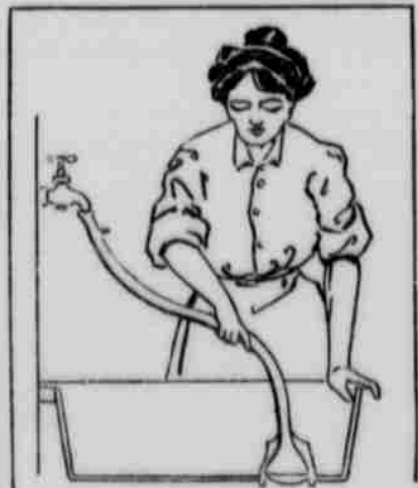
Drain Pipe Cleaner.

One of the most useful of all recent inventions for the home is the drainpipe cleaner designed by a Michigan man. This not only enables a