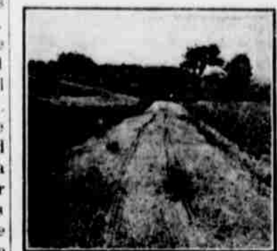
A TYPICAL RURAL EARTH ROAD.

It must be remembered that no matter how good a stone road is constructed there is a certain amount of wear and tear each day and month and year.