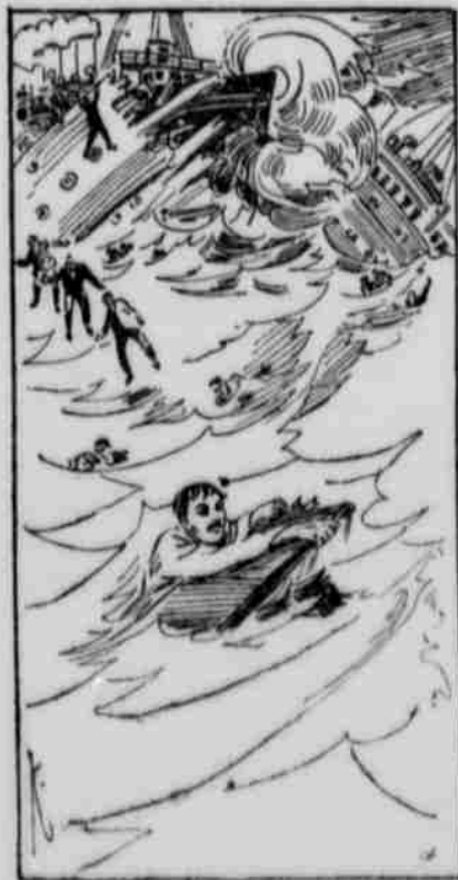
Hurled into School of Sharks.

The force of the collision brought the Onda to almost a dead stop and her engines were at once slowed and boats lowered. The rescue work proved thrilling, for not only were the