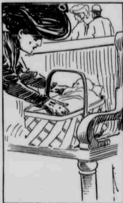
Baby in Basket in Railroad Station.

Pittsburg, Pa.—One bitter cold day in December, 1861, a soldier of the civil war on his way to the south to join his regiment found on abandoned baby girl two weeks old in a chip basket on a seat in old Union Station. The big blue eyes and smiling face of the infant appealed to the soldier,