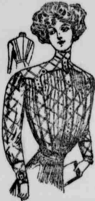
Smart Crepe de Chine Bodice.

Of course, the waist could be copied in simple material for ordinary wear, but as the design is somewhat fixy it had best be kept for the dress-up occasions.