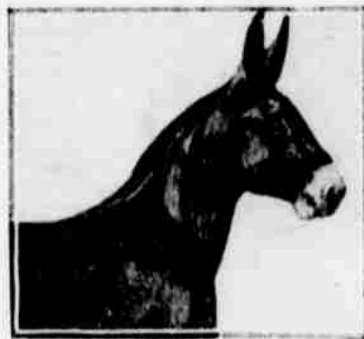
GOOD HEAD AND CARRIAGE.

Of some 250,000 mules sold annually in this country at present Missouri furnishes perhaps 70,000, Tennessee 60,000, Texas over 50,000 and Kentucky about an equal number, the sales being double the number foaled. The mules of the states in the northwest are very large of bone, body, substance and power, but have not usually the style, finish and fine sleek coats of southern mules. In the south mule