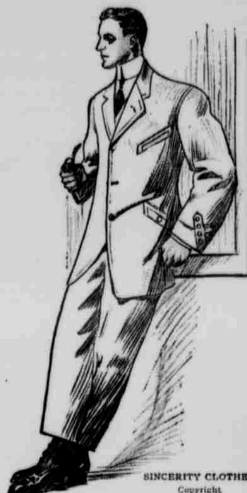
SINCERITY CLOTHES Copyright

Every shade and weave that's correct are shown at