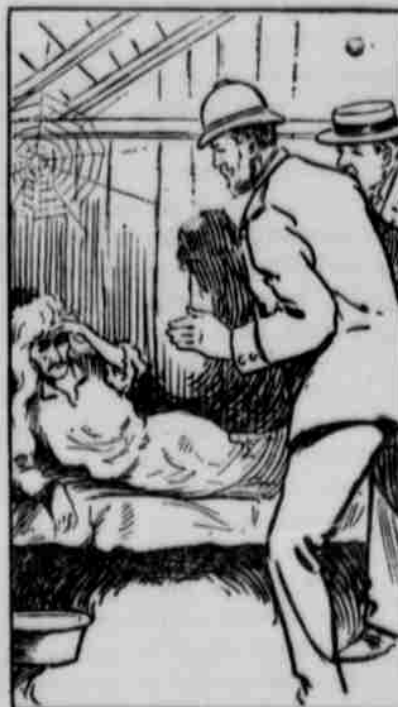
"My Son, is That You Come to See Me?"

"The Humane society, acting as the agent of public opinion, will consult the attorneys of the society at once