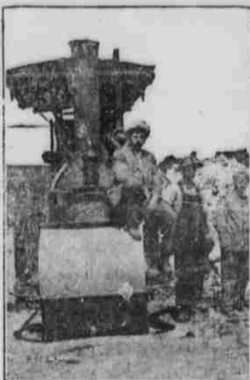
Rolling a Road Surface.

This investigation is prompted by the fact that there is at present very little knowledge as to the most effective and economical methods by which a county can develop its roads. At present the methods of financing local road improvements vary from