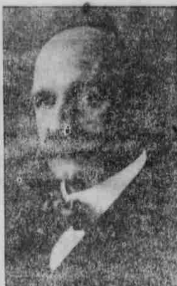
GENERAL COLEMAN DU PONT.

The Republicans will probably go back to old principles and look for a candidate who will command the support of the same army of voters who elected McKinley, when a wave of patriotic common sense swept the country, and business men by the hundreds of thousands marched the streets demanding a practical government. It is interesting to note that the name of General Coleman du Pont, of Delaware, has been repeatedly mentioned recently as the man eminently qualified for the nomination. To those who look upon the government as a big business concern demanding the supervision of a trained business man, the name of General du Pont carries a strong appeal, for there is no man more qualified to handle the big problems of today than this same self-made leader in constructive business. Moreover, both the public and private record of General du Pont will stand up well under the searchlight of political opposition.