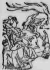
Flight of Lot.

St. Paul emphasizes this point in Hebrews 11:38-40, declaring that while the Ancient Worthies received indications of God's favors, nevertheless that favor can come only through Christ. Consequently they cannot reach everlasting life until the Spiritual Seed of Abraham shall have been completed. Jesus also attested that they had not gone to Heaven, saying, "No man hath ascended up to Heaven."—John 3:13.