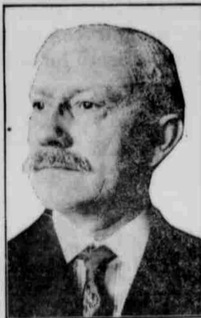
Richard A. Ballinger.

During these years he studied the classic languages, riding many miles across the plains each week to recite his lessons, and by his own efforts he prepared himself for college, where he was a classmate of James R. Garfield, who, a quarter of a century later, made him general land commissioner.