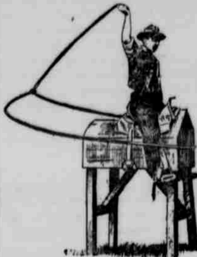
First Lesson in "Roping" in School for Cowboys.

London.—Notwithstanding the very general impression that the cowboy's vocation is about gone, and that he is a vanishing type, the few remaining specimens of which have gone into vaudeville, there is, in fact, quite a brisk demand for the service of the cowboy in many parts of the world.