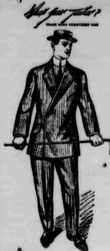
Design 564 Two-Button Double-Breasted Novelty Sack

and Summer embrace all the varying tones of slate, green, gray, bronze, olive, brown, tan, stone and khaki shades in stripe, check and soft plaid designs. The