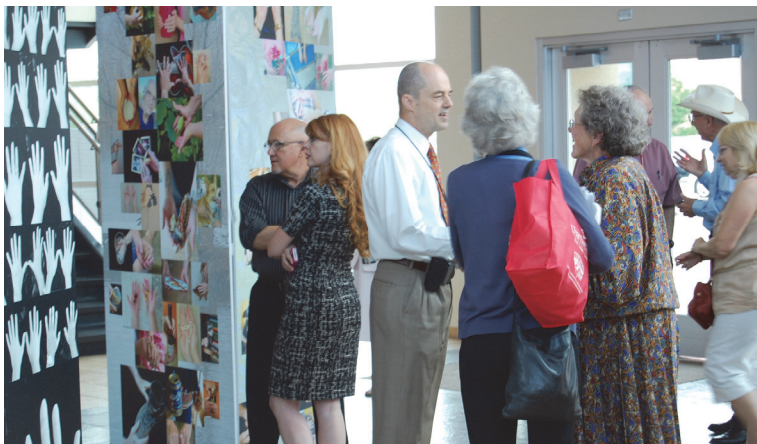
Almost 70 people attended the opening reception to welcome the “Joining Hands” exhibit to UNM’s Domenici Center.

The “Joining Hands” exhibit, which HSLIC showcased in April and May, features photographs taken as part of a community strengthening project in Albuquerque’s Alvarado Gardens neighborhood. HSLIC also hosted an opening reception and a panel discussion titled “Building Healthier Communities.”