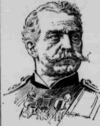
Lieut. Gen. Nelson A. Miles.

"In our campaign to capture Geronimo and his band, we pursued exactly the tactics we used to employ in capturing wild horses on the plains. You