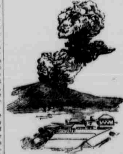
Mount Colima in Action.

To the natives the eruption does not portend their possible destruction. But they fear the earth tremblings which frequently accompany the eruptions. An earthquake in Tuxpan, such as has been occurring at frequent intervals since the volcano showed renewed signs of activity, quickly brings