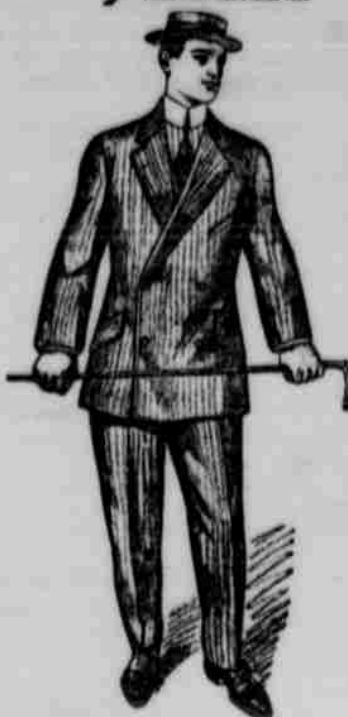
Design 564 Two-Button Double-Breasted Novelty Sack

What four tailors? TRADE MARK REGISTERED 1908