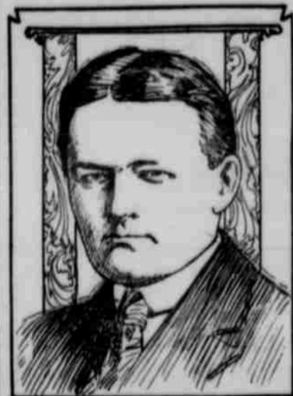
HENRY P. DAVISON

To men of finance the name of Henry P. Davison is very familiar.