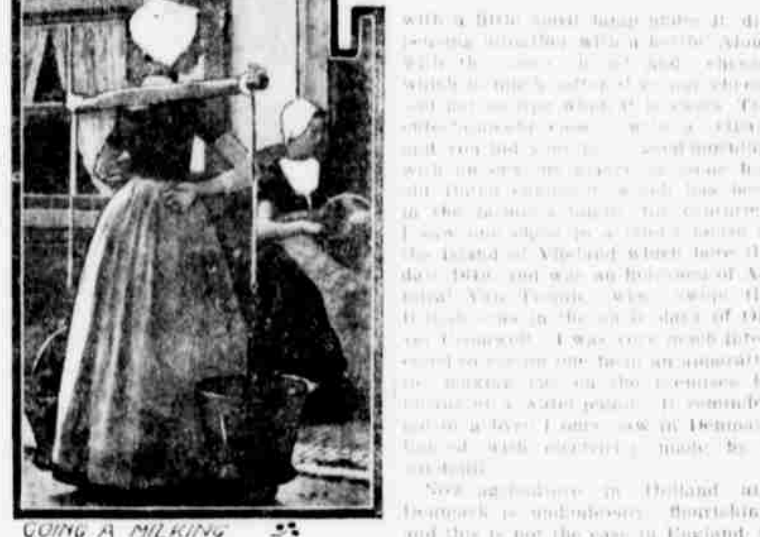
GOING A MILKING

The Dutch are famous for their milk. They have a fine system of milking, and they produce a large quantity of milk. The Dutch are famous for their milk, and they have a fine system of milking. They produce a large quantity of milk, and they have a fine system of milking.