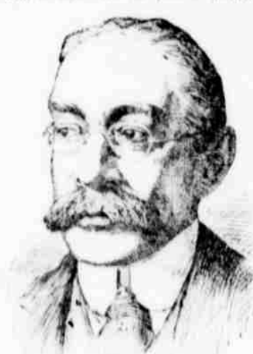
George W. Wickersham.

New York. George W. Wickersham, who is noted for his work as attorney