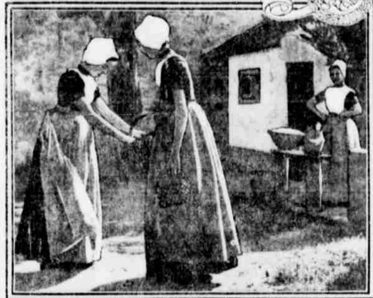
AT THE DAIRY