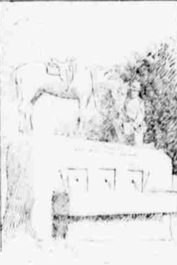
Monument to Dead Horses.

London. Horses killed in battle have been a memorial to their valor. It is a fine memorial to them erected in South Africa. The memorial is a large stone structure, and it is very beautiful. It is a fine memorial to them erected in South Africa.