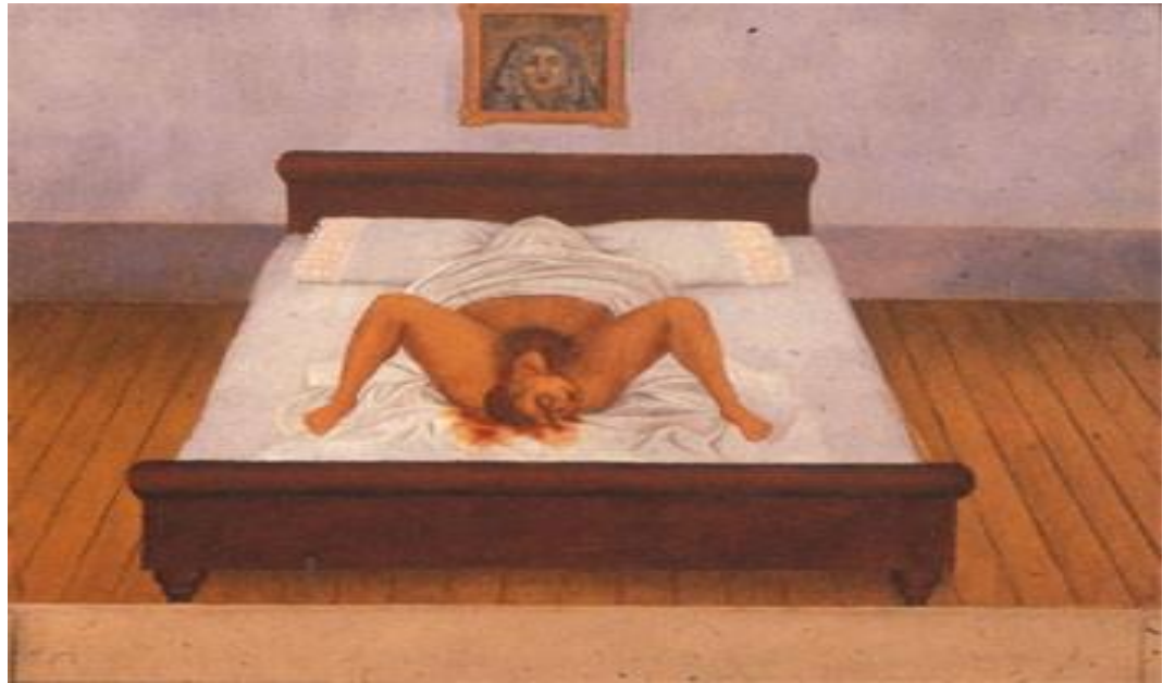
Figure 6b. An image of My Birth (1932), By Frida Kahlo.