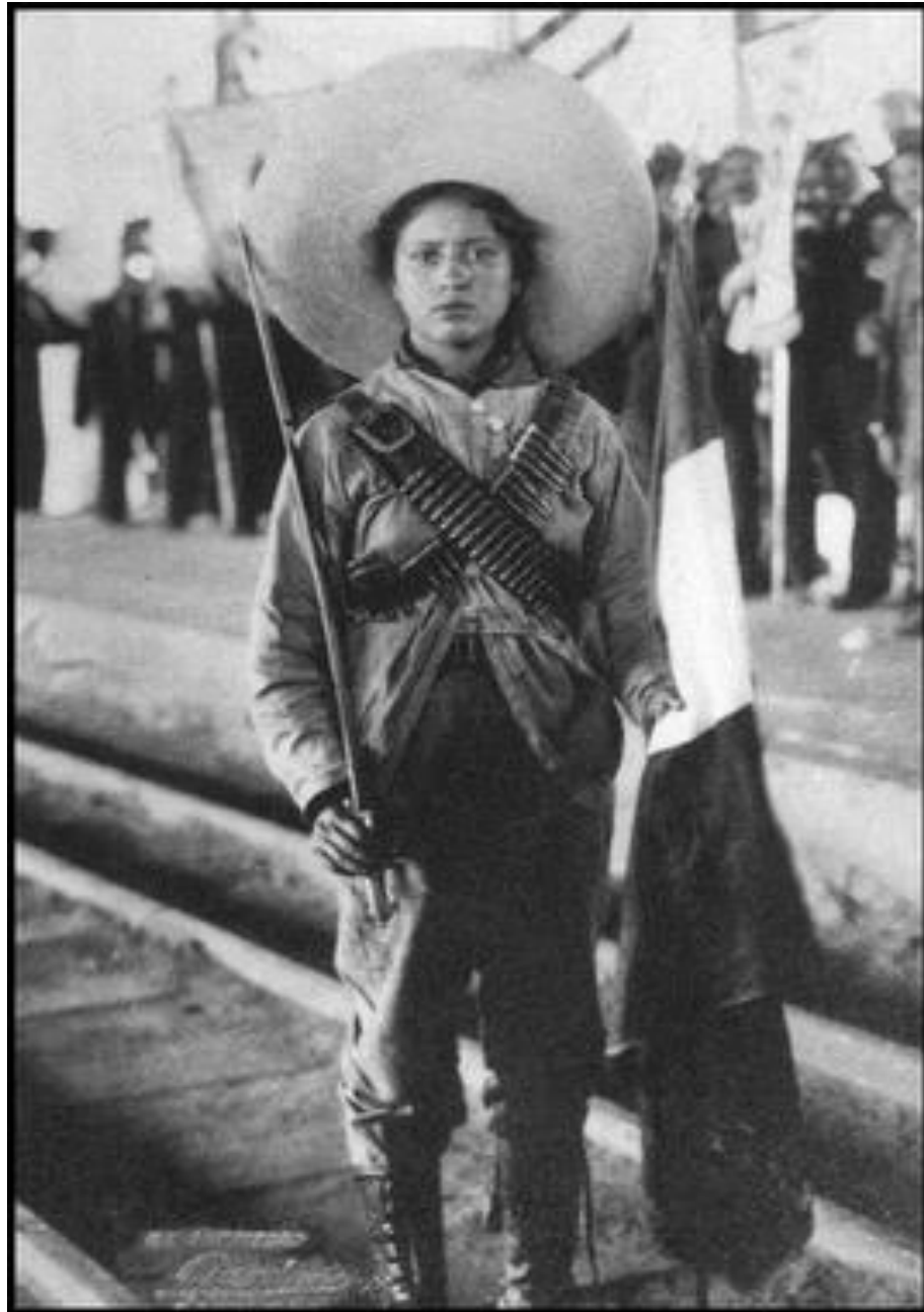
Figure 5. A real Soldadera in the Mexican Revolution.