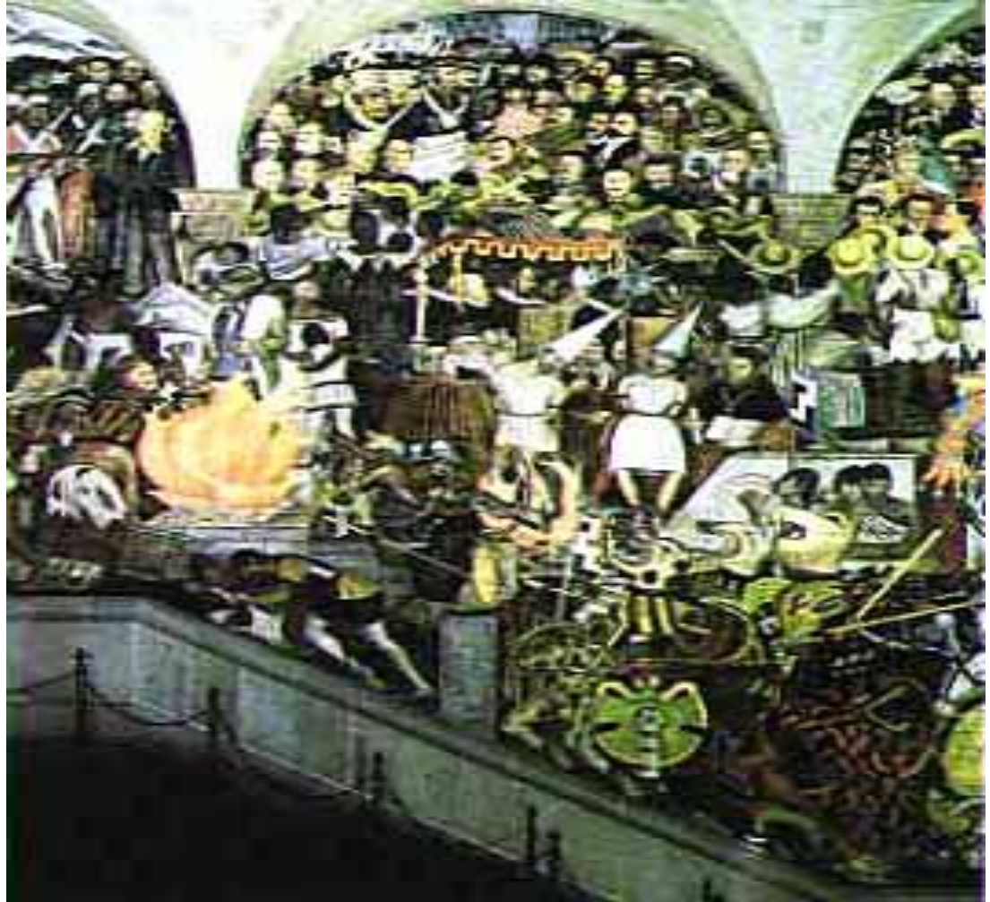
Figure 8. Detail of Mural showing Malinche and the son she shared with Cortes, Martín.

Partial shot of La Historia de Mexico de la Conquista al Futuro , by Diego Rivera