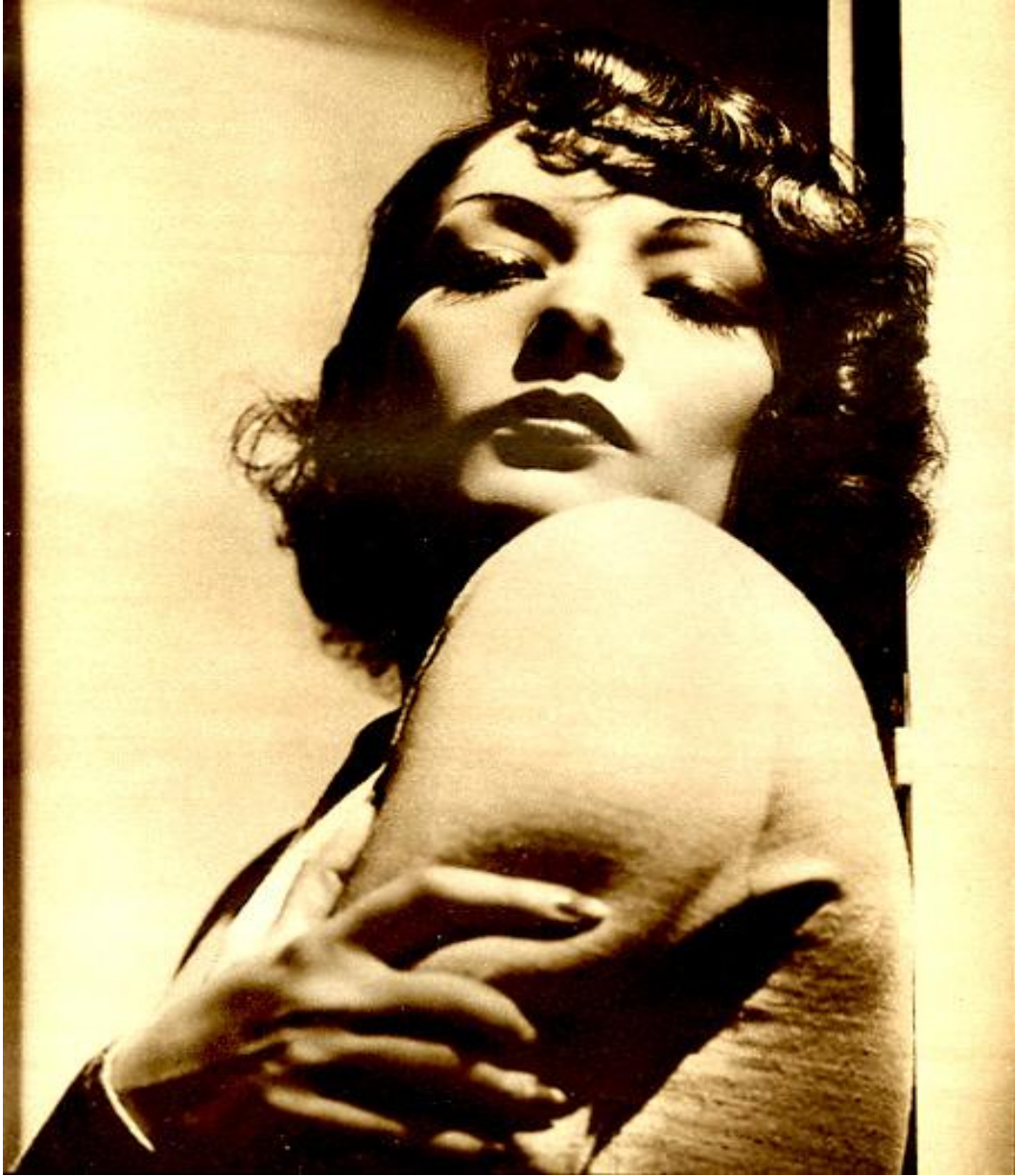
Figure 9. Photo of Lupe Velez, courtesy of Hurrell's Hollywood Portraits.