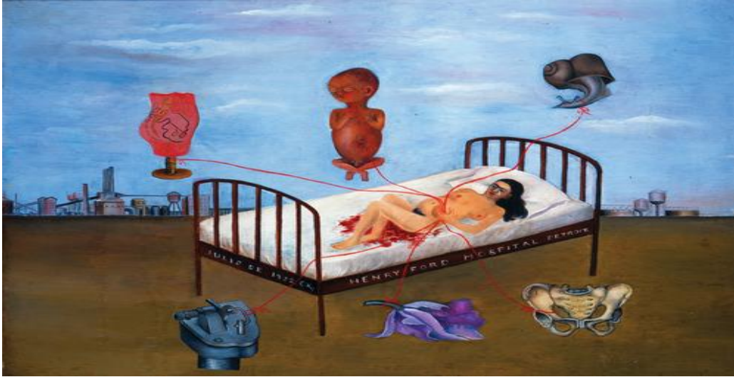
Figure 6a. Image of Henry Ford Hospital (1932), by Frida Kahlo.