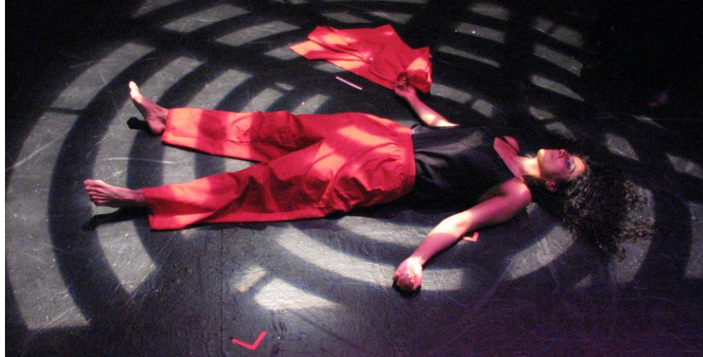
Figure 3a. Medea in her Inner World.