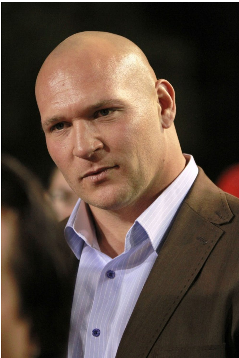
Brian Urlacher at a retirement ceremony in 2013.

"We will not support anyone, notable alumni or not, who believes it is acceptable for an unarmed Black man to be shot seven times in his back in front of his children," the BSU's statement read. "It is horrific that Brian Urlacher could share memes/propaganda condoning the attempted murder of Jacob Blake."