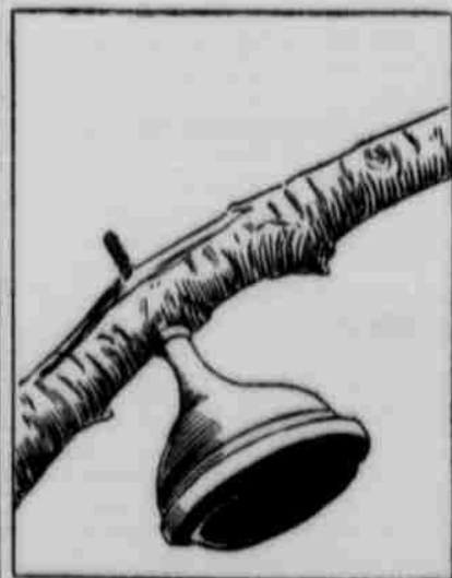
Caster Driven Through Tree Limb.

That a number of houses should have been wholly and in part destroyed is naturally to be expected of any cyclone that is at all violent. But that it should pick up a caster from a table, twist off the handle and drive the spindle through the branch of a walnut tree is surely no common occurrence. Mr. Bricker assures us that before the storm the caster found a place on the table of Mr. G. F. Franks, that it was intact with the bottles in their intended positions; yet after the tornado the base was found in a walnut tree limb, exactly as it is shown in the accompanying photograph. The wind had unscrewed the top and taken