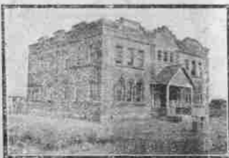
PUBLIC SCHOOL BUILDING Belen, New Mexico