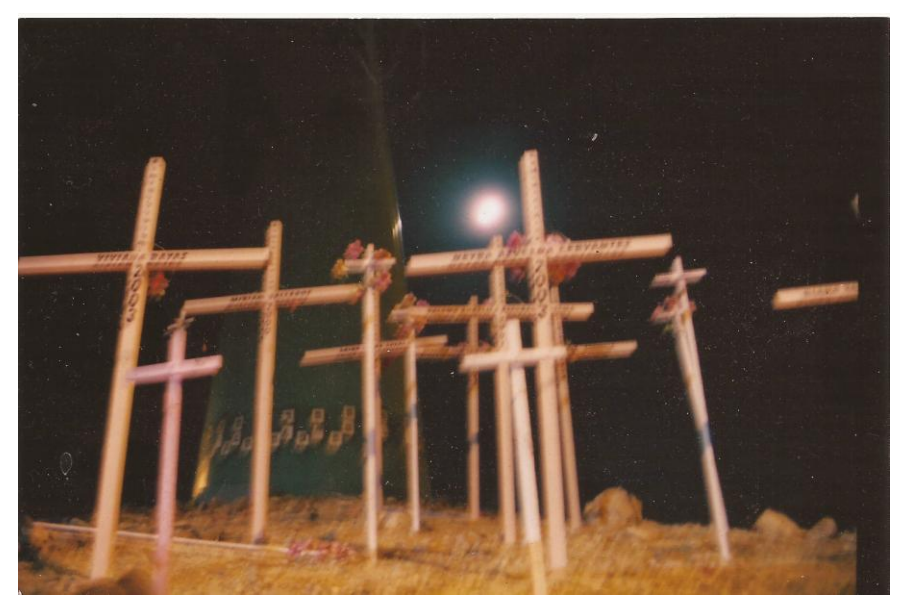
Figure 4. Cruces Rosas Descanso Chihuahua, México

The opportunity presents itself to introduce an entirely different approach to viewing a descanso when I analyze the customary function of public memorials that are erected to memorialize someone who has died. To be reminded of a tragic death more specifically, is at the core of most references to roadside descansos . And in the case of a public descanso calling attention to the murdered mujeres de Chihuahua, it becomes possible to draw a parallel with the representation of Pascualita in her wedding dress in the window display at La Popular Dress Shop as a descanso . Pascualita's story evokes a particular historical identity for women (in México) as a bride to be. As noted in my interviews, the community of Chihuahua remembers Pascualita as having died tragically but it is the stories about her mother who is overcome by grief and "puts her daughter in her wedding dress in the shop window," possibly to immortalize Pascualita that reveals the importance of remembrance. Over time Pascualita has become a descanso , as people pass by they remember her story and in some cases offer prayers or make the sign of the cross as noted in my previous chapter. Jaime Morales Gutiérrez relates the legend of