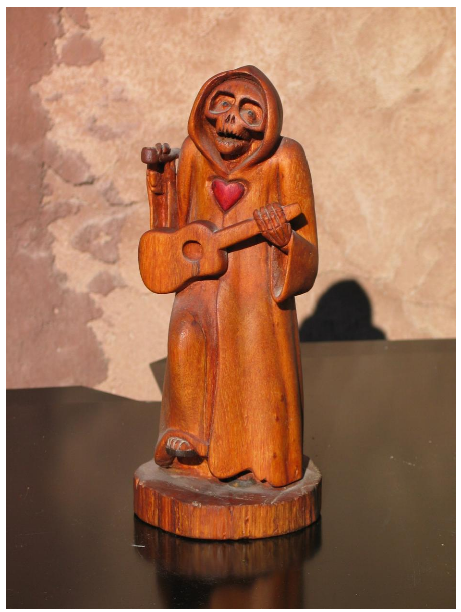
Figure 9. "La Muerte" Tom Borrego, 1995

Communal reverence for the dead is perhaps most obvious in the celebrations associated with Día de los Muertos (Day of the Dead). The differences in celebrations in New Mexico of Día de los Muertos with celebrations in México has its' own unique story and has become a national celebration throughout the México. But it was the absence of any mention of the Church's role in Día de los Muertos celebrations that led me to the question, why was the practice México different? Día de los Muertos is an indigenous