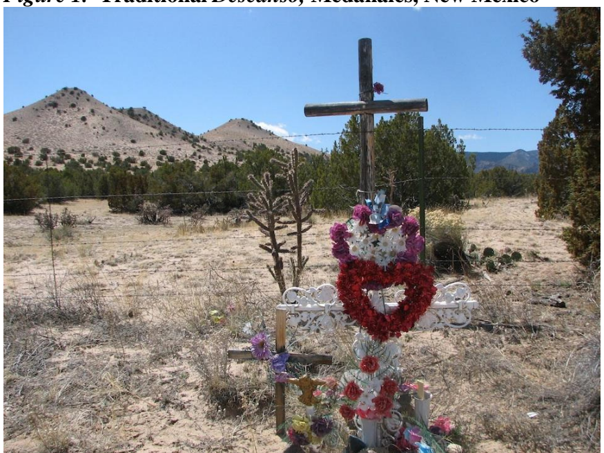
Figure 2. Contemporary Descanso, Tierra Azúl, New Mexico

Figure 1. Traditional Descanso, Medanales, New Mexico<sup>85</sup>