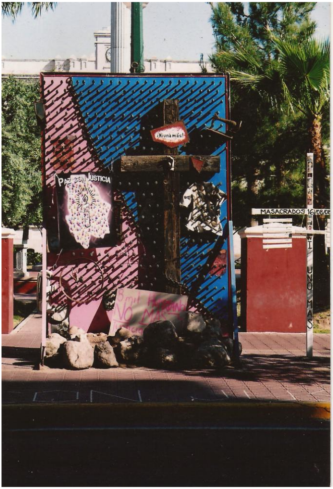
Figure 3. ¡Ni una Más! Memorial Chihuahua, México

Justicia (Peace with Justice) and on the ground in front of the sculpture is a shallow grave representing one of the murdered women. The descanso was built in front of the Governor's Palace intended to bring attention to the deaths of women factory workers. Driving around Chihuahua City, I noted descansos in certain areas along the road, but of particular interest were pink colored crosses more recently erected also as memorials to the women who died violently.