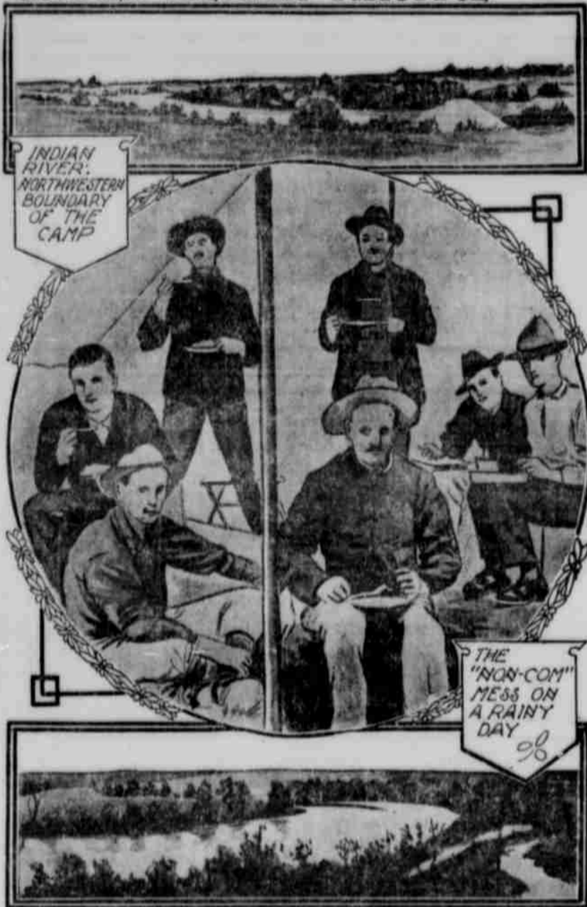
BLACK RIVER, SOUTHERN BOUNDARY OF THE NEW CAMP

UNCLE SAM'S SOLDIERS AT THEIR SUMMER MILITARY PRACTICE