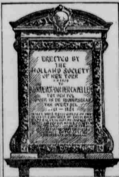
Tablet Set Up as Token of Gratitude.

"Erected by the Holland society of New York, A. D. 1908, to Joan Derek van der Capellen tot den pol Ridder in der Ridderschap Van Overysel, 1741-1784, in grateful recognition of the