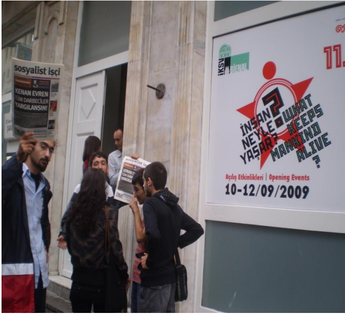
FIGURE 2.3. Protest against the 1980 Turkish coup d'état killings, held on the 29th anniversary of the coup d'état, September 12, 2009. Photograph taken by the author in Istanbul, Turkey, September 12, 2009.