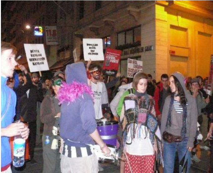
FIGURE 2.5. Protest against the 11th Istanbul Biennial. Photograph taken by the author in Istanbul, Turkey, September 12, 2009.