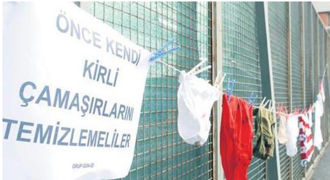
FIGURE 2.1. Protest against the 9th Istanbul Biennial by a group known as “Grup Gunizi.” Photograph taken by the author in Istanbul, Turkey, September 10, 2005.