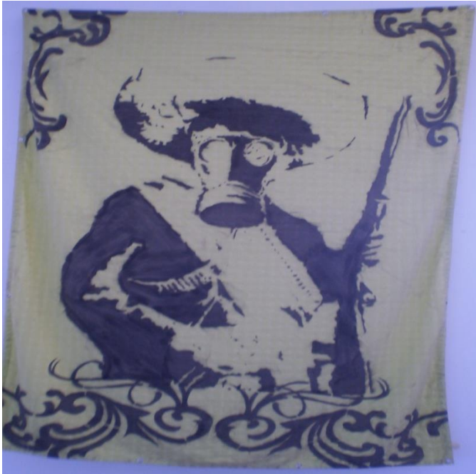
FIGURE 3.6 Woodblock print on cloth by ASARO showing Emiliano Zapata with a gas mask in the Bisagra exhibition at the 10th Havana Biennial.