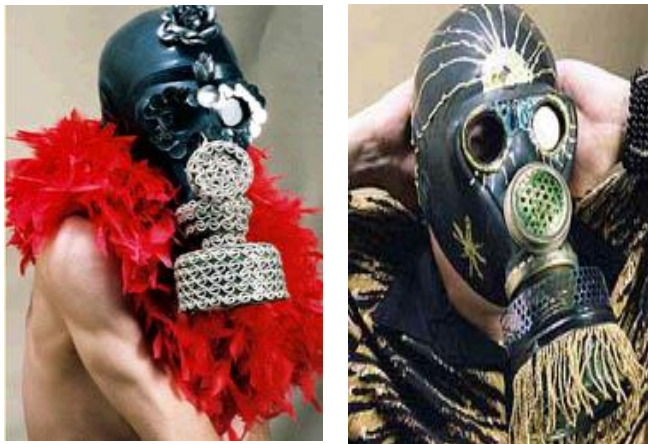
FIGURES 3.1. Photographs showing the masks used for the performance Masquerade Project during the 2001 IMF and World Bank protests in Washington D.C., 2001.