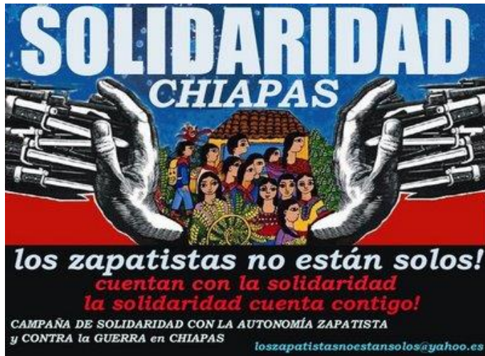
FIGURE 4.12 Anonymous, Solidaridad Chiapas , poster, 2010. Photograph taken by the author in San Cristobal de las Casas, Chiapas-Mexico, January 10, 2009.