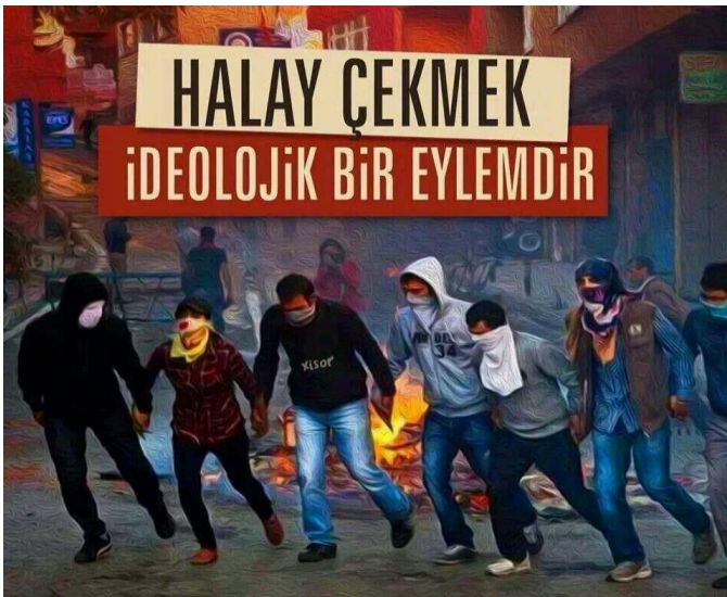
FIGURE 3.19. A popular image circulated on social media during Gezi uprising showing a halay dance. Caption reads “Halay is an ideological act.”