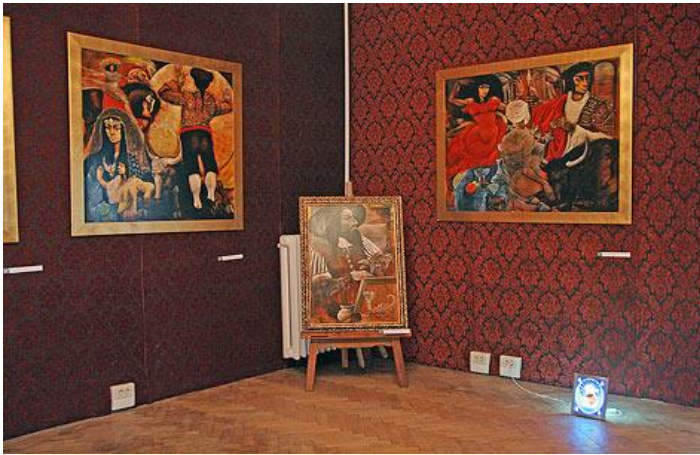
FIGURE 1.5. István Szentandrassy's paintings in the "Paradise Lost" exhibition at the 52nd Venice Biennial. Photograph taken by the author at the Venice Biennale in Venice, Italy, July 11, 2007.