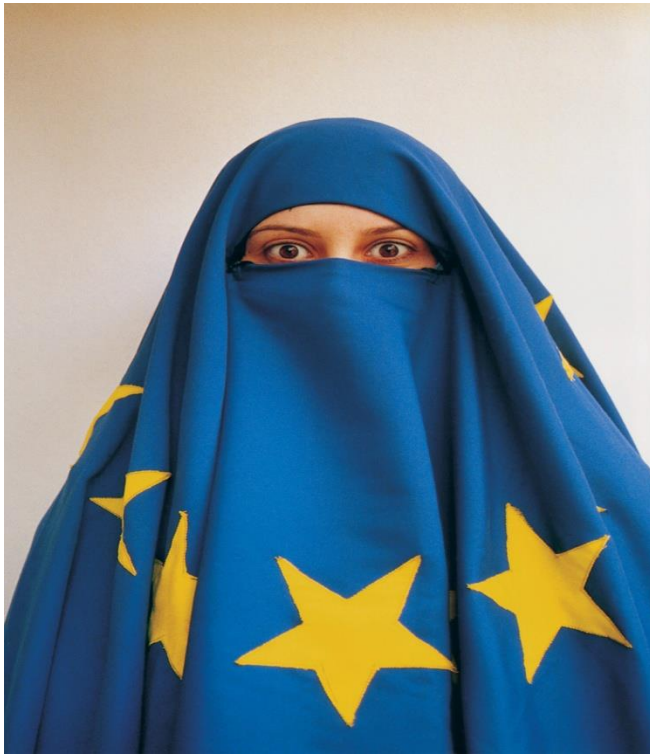
FIGURE 1.3. Burak Delier, Untitled , photography, 2004.