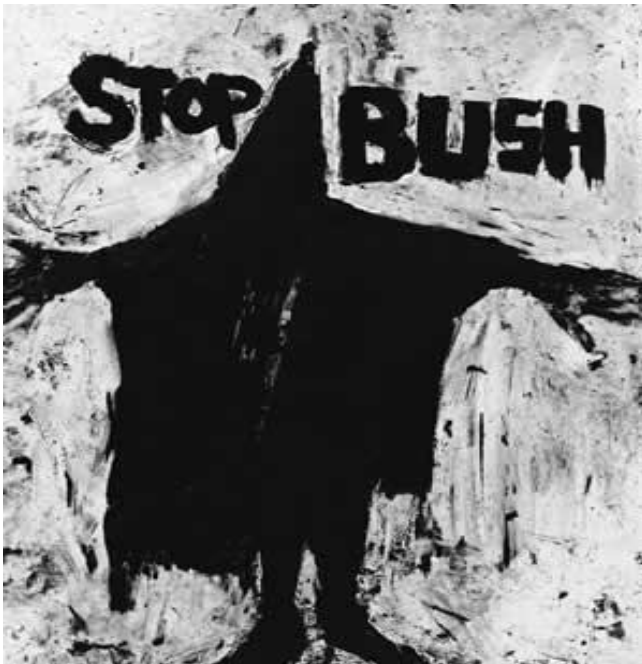
FIGURE 1.4. Richard Serra, Stop Bush , lithograph, 2004.