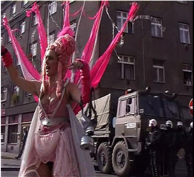
FIGURE 3.2. Marcelo Expósito, Tactical Frivolity: Rhymes of Resistance , video still, 2007.