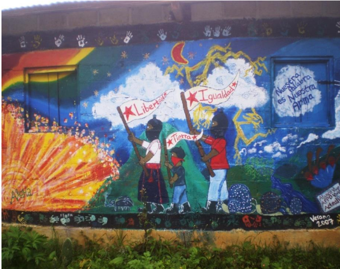
FIGURE 4.8. Mural by the solidarity group Red de Solidaridad in caracol Oventik executed in 2007. Photograph taken by the author in Oventik, Chiapas-Mexico, January 22, 2012.