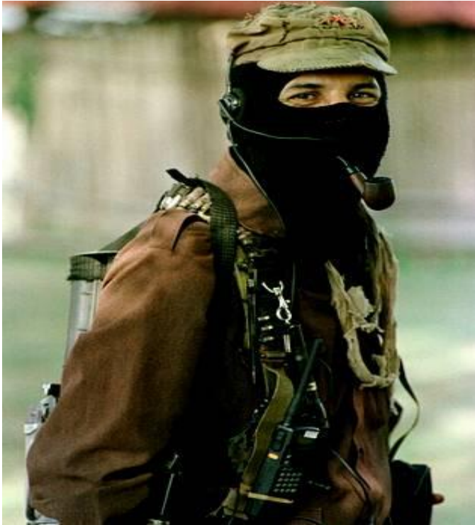
FIGURE 4.2 Photograph of Subcomandante Marcos of the Zapatistas.