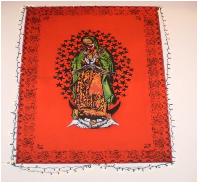
FIGURE 4.4. Anonymous, Guadalupe as Zapatista Guerilla , oil on canvas. Photograph taken by the author in San Cristobal de Las Casas, December 4, 2009.