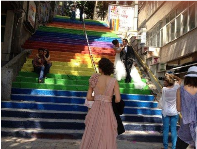
FIGURE 3.15 A view of the public enjoying the first rainbow stairs painted by Hüseyin Çetinel in Istanbul.