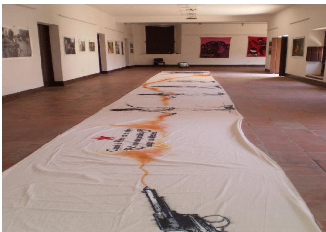
FIGURE 3.5. A general view of the Bisagra exhibition on the Teacher's Uprising in Oaxaca in 2006 at the 10th Havana Biennial. Photograph taken by the author in Havana Cuba, March 12, 2009.