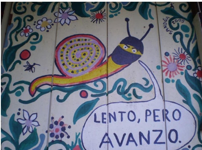
FIGURE 4.9. Community mural in caracol Oventik. Caption reads “Slowly But I Advance.” Photograph taken by the author in Oventik, Chiapas-Mexico, January 22, 2012.