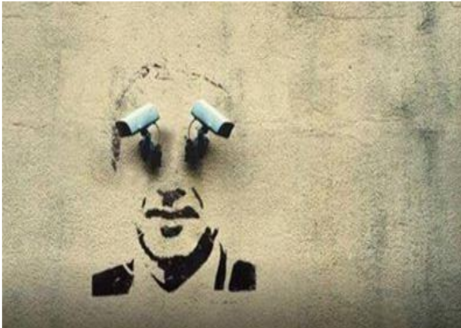
FIGURE 3.9. Street graffiti in Istanbul making use of video surveillance cameras to mock Prime Minister Recep Tayyip Erdoğan during the Gezi uprising. Photograph taken by the author in Istanbul, Turkey, July 10, 2014.