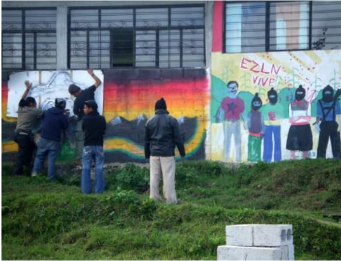
FIGURE 4.10. Photograph of the young Zapatistas and the artists painting murals on the walls of the secondary school in caracol Oventik.