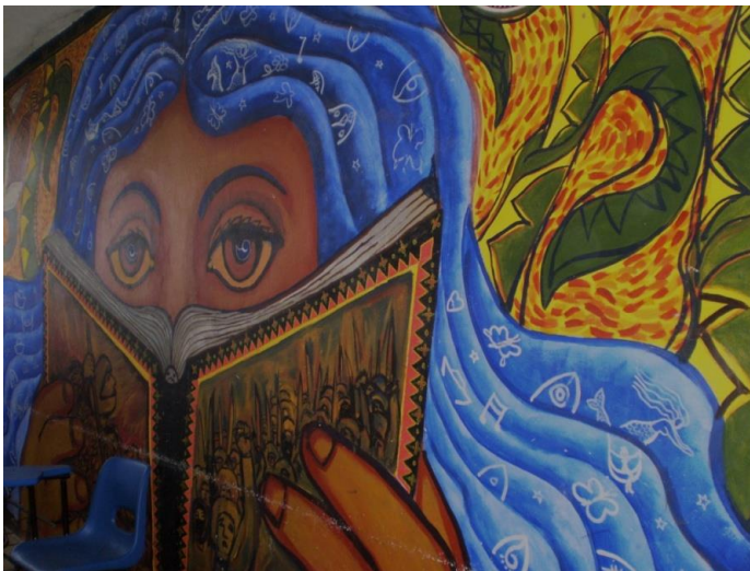
FIGURE 4.11. Mural by Gustavo Chávez Pavón in one of the classrooms of the secondary school in caracol Oventik, executed in 2002. Photograph taken by the author in Oventik, Chiapas-Mexico, January 22, 2012.