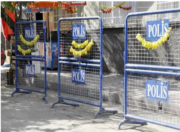
FIGURE 3.17. An image of Nadire Kaya's display of discontent with the excessive police force in front of her house in Elazığ, Turkey, 2013.