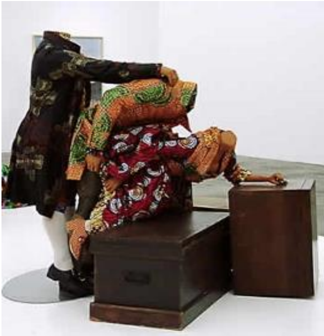
FIGURE 1.1. Yinka Shonibare, Gallantry and Criminal Conversation , Installation, 2002.