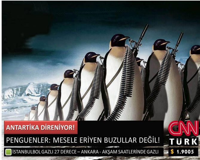
FIGURE 3.8. An image that circulated on social media mocking the TV channel CNN Türk that broadcast a documentary of the penguins for two hours instead of reporting the Gezi uprising. Caption reads: “Antarctica is Resisting! Penguins: The Problem is Not the Melting Ice!”