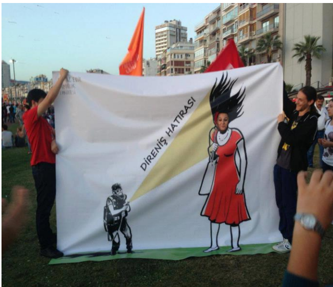
FIGURE 3.7. Young people in Kordon-Izmir taking pictures with the iconic image of the Gezi uprising “the woman in red.” Caption reads “souvenir of resistance.”