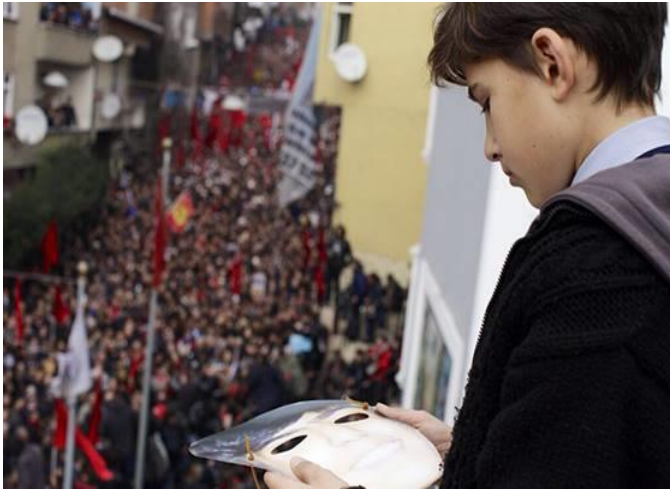
FIGURE 3.18. An image of a boy holding a mask of Belkin Elvan, who was shot-dead by the police during Gezi revolt, at the largest funeral procession in Istanbul.