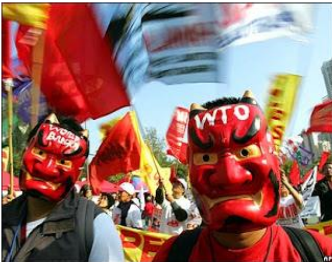
FIGURE 3.3. Anti-globalization demonstrations in Seattle, 1999.