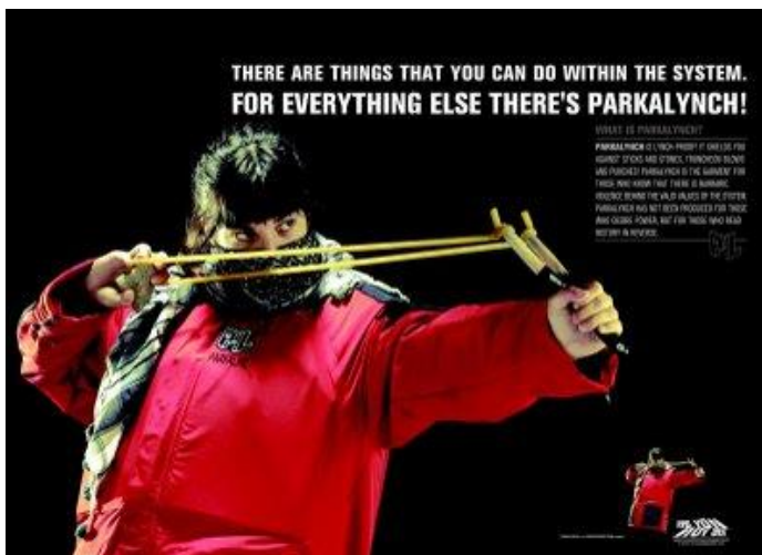
FIGURE 2.2. Burak Delier, Parkalynch , Mixed Media, 2007.