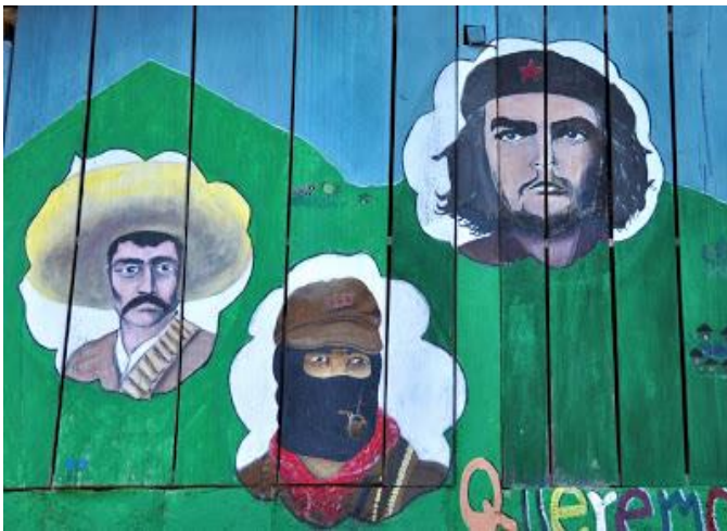
FIGURE 4.3. Mural on the wall of a middle-school building of the Zapatistas in caracol Roberto Barrios. Photograph taken by the author in Roberto Barrios, Chiapas-Mexico, December 12, 2009.