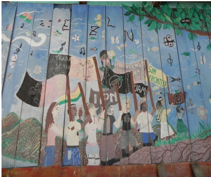
FIGURE 4.13. Mural by the solidarity group Red de Solidaridad in caracol Oventik, executed in 2009. Photograph taken by the author in Oventik, Chiapas-Mexico, January 22, 2012.