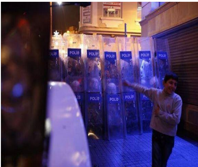
FIGURE 3.13. A popular image circulated on social media during Gezi uprising that mocks the excessive police force in Istanbul.