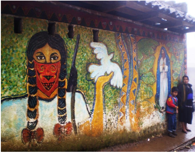
FIGURE 4.6. Mural on the outside wall of the chapel in the village of San Pedro Polhó. Photograph taken by the author in San Pedro Polhó, Chiapas-Mexico, January 30, 2012.