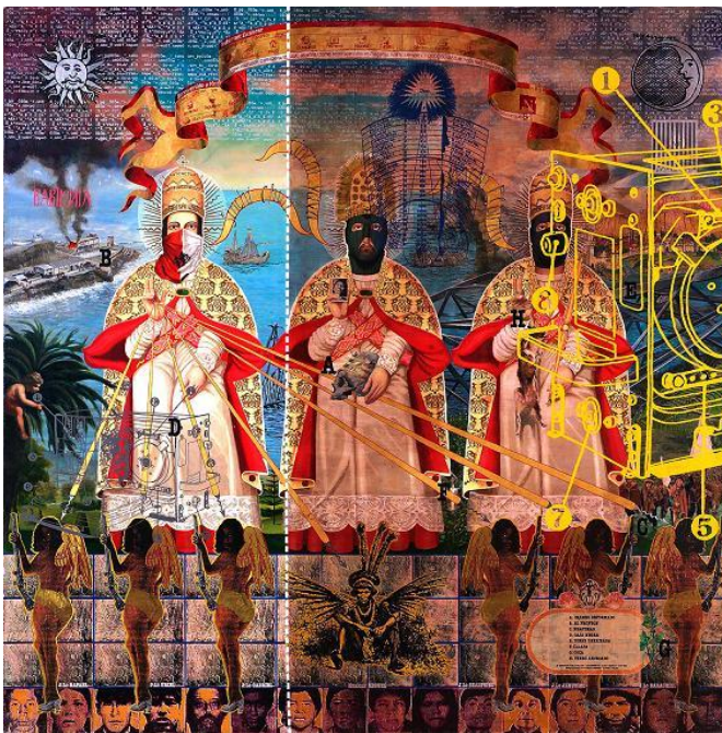
FIGURE 1.2. Alfredo Márquez and Ángel Valdez, Black Box , Mixed Media, 2001.