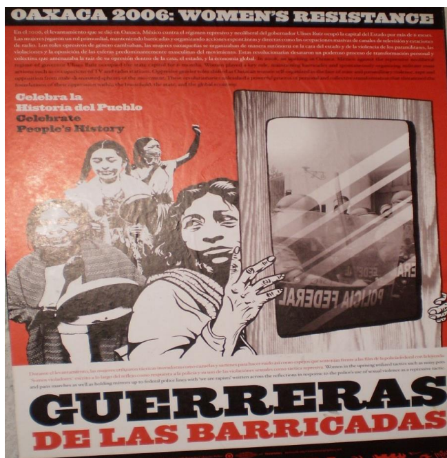
FIGURE 3.4 Anonymous, Oaxaca 2006: Women's Resistance , silkscreen poster, 2006.