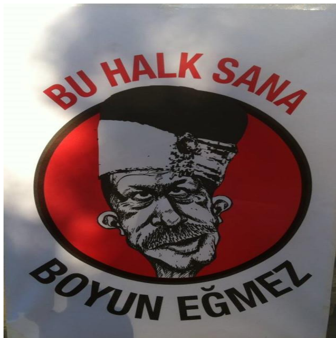
FIGURE 3.11. A poster with a satirical image of Prime Minister Recep Tayyip Erdoğan as a Sultan, hung at a bus stop in Istanbul. Caption reads “This public does not bow to you.”