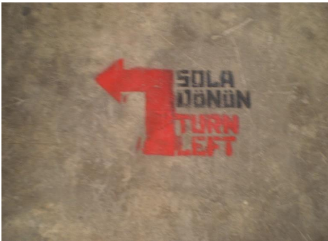
FIGURE 2.6. One of the graffitied signs on the floors of the venues at the 11th Istanbul Biennial. Photograph taken by the author in Istanbul, Turkey, September 15, 2009.