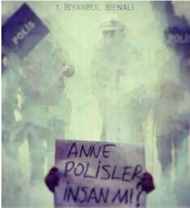
FIGURE 2.9. A boy holding a sign showing the caption, which mocks 12 th Istanbul Biennial: “Mom, are police human?”