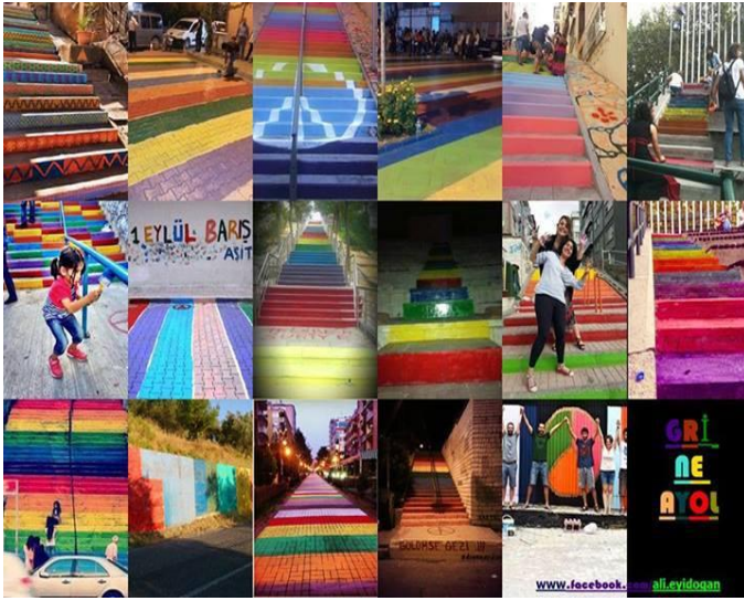
FIGURE 3.16. Images of rainbow stairs in various parts of Turkey.