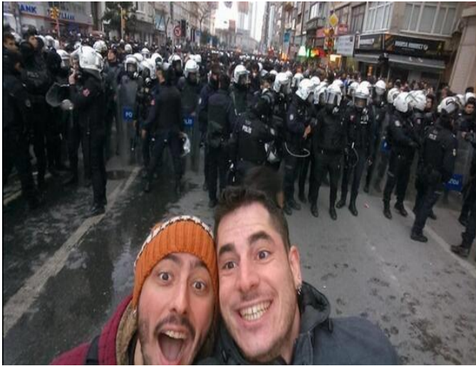
FIGURE 3.12. A popular image that circulated on social media during Gezi uprising that mocks the excessive police force in Istanbul.