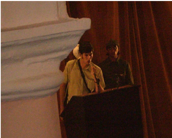
FIGURE 1.6. Tania Bruguera, Tatlin's Whisper #6 , installation with stage, podium, loudspeaker, video camera, microphones, and color video, with sound, 2009. Photograph taken by the author at the Havana Biennial, Cuba, March 12, 2009.