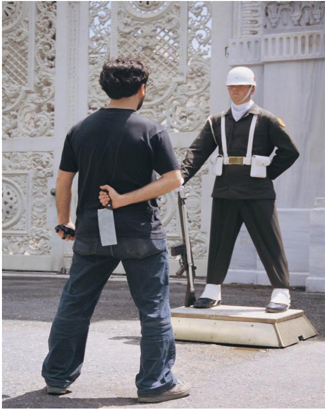
FIGURE 2.7. Burak Delier, Guard , photography, 2005.