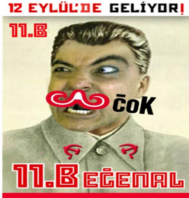
FIGURE 2.4. Poster mocking the 11th Istanbul Biennial. Photograph taken by the author in Istanbul, Turkey, September 5, 2009.