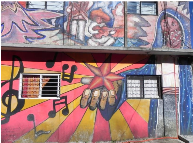
FIGURE 4.5. Mural on the outside wall of the Clinica Guadalupe, Oventik, Chiapas.