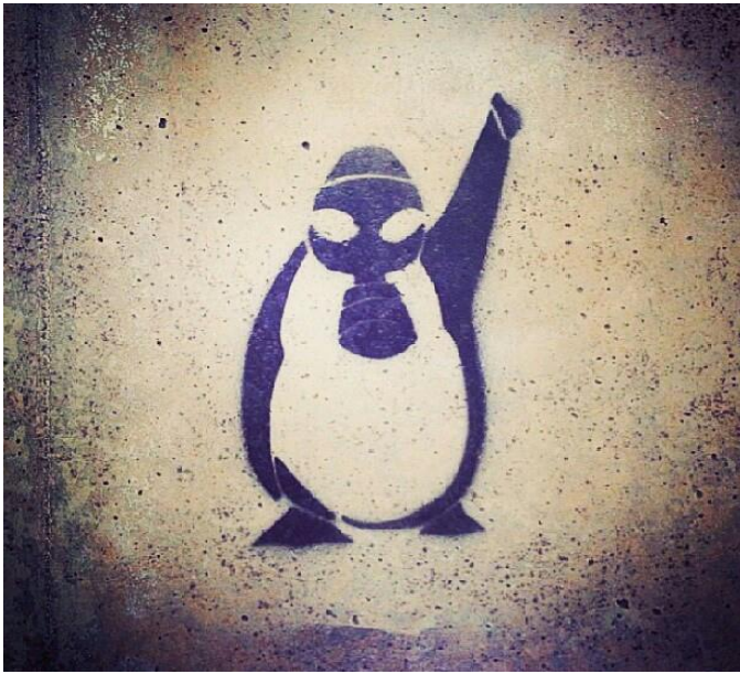
FIGURE 3.10. Street graffiti in Istanbul during Gezi uprising that shows a Penguin as a protestor—a humorous commentary about the TV channel CNN Turk that broadcast penguins instead of the Gezi uprising.