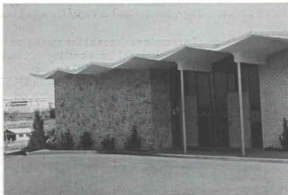
ARCHITECT — RALPH PHILLIPPI CONTRACTOR — KEALY CONSTRUCTION CO.

MORE BUILDINGS FEATURING CONCRETE CONSTRUCTION ARE BEING ERECTED. THE REASON IS THE LASTING BEAUTY AND VERSATILITY OF CONCRETE.