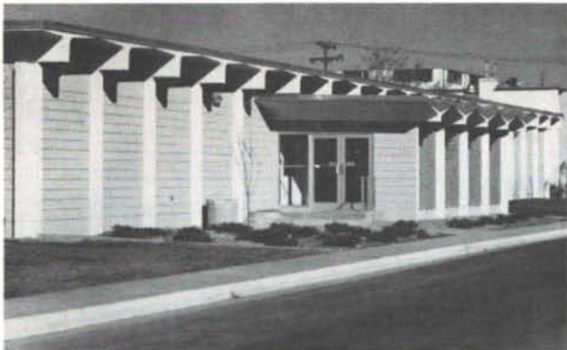
New Electrical Research Laboratory Building, Kirtland A. F. B. Featuring pre-stressed concrete single tee roof members. Architect and Engineer: ORAVEC & CRAWFORD Contractor: FRANKLIN CONSTRUCTION CO.