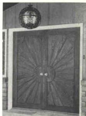
The "INCA" sunburst motif