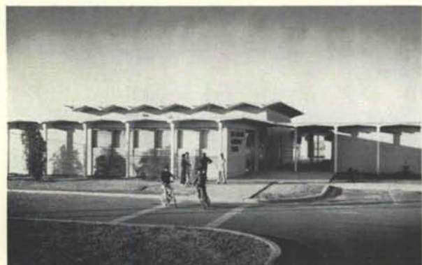
LOS PADILLAS ELEMENTARY SCHOOL WILLIAM W. ELLISON, ARCHITECT