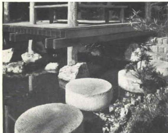
Rugged concrete "islands" provide attractive access to tea house. Landscape Architect: Phil Shipley.

A national organization to improve and extend the uses of concrete