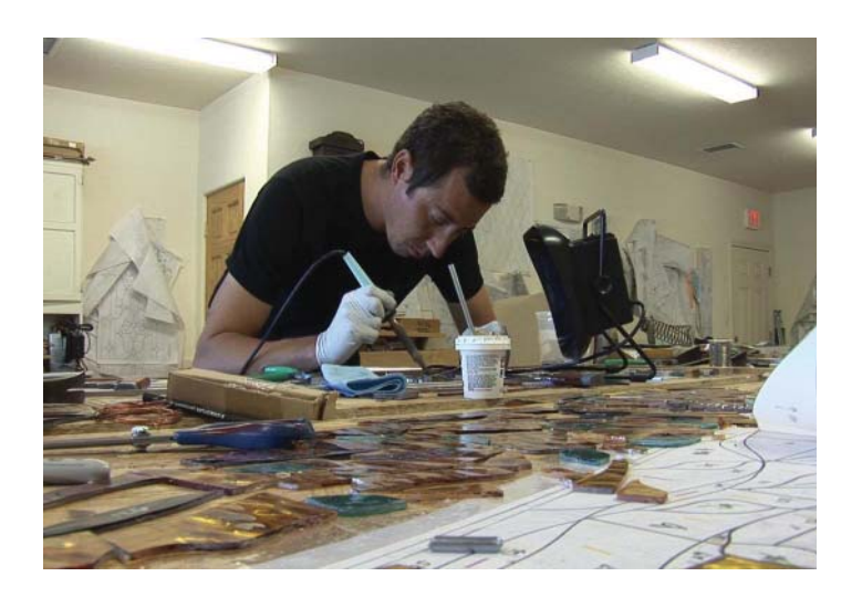
NASSAF III III