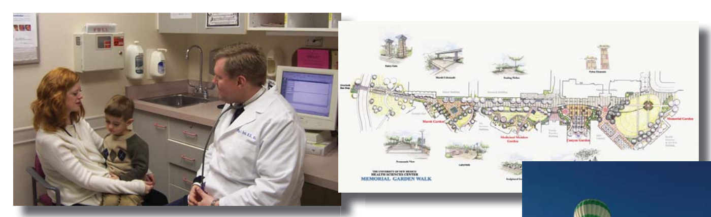
United Way Contributions to HSLIC

The University of New Mexico's United Way theme this year is "Giving Makes Life Better." For those who find assistance through the many and varied programs supported by United Way, this is truly a blessing.