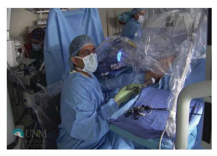
Robotic Surgery at UNM