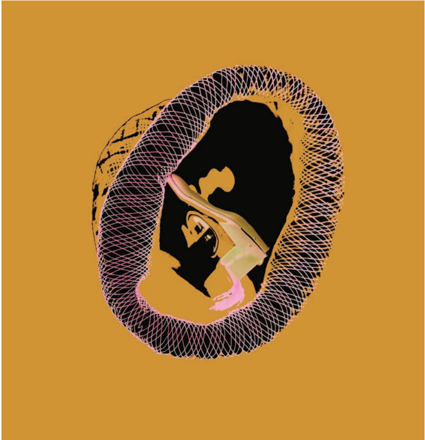
Plate 1. Marcie Rose Brewer, Bloodroot Basket , 2016, inkjet pigment print, 40" x 40".