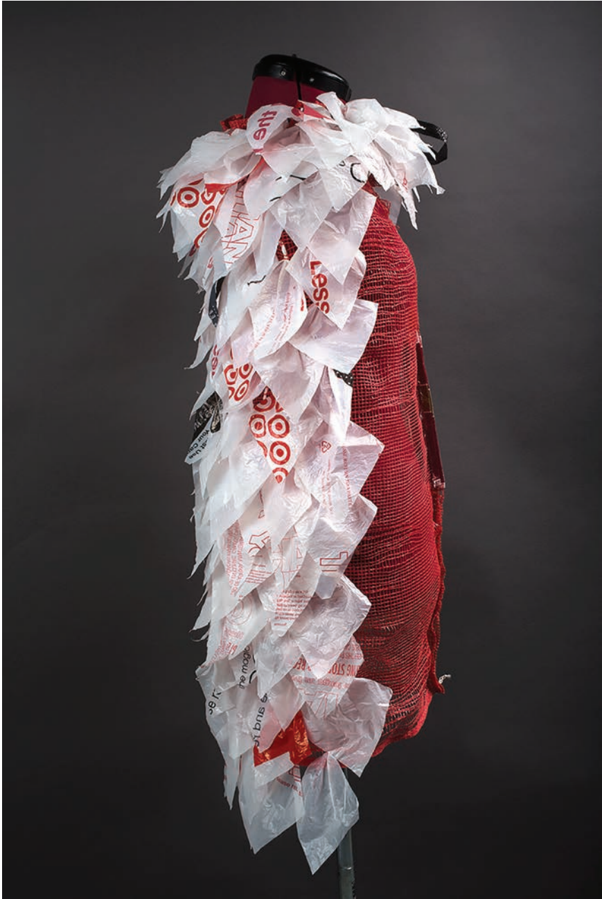
Plate 2. Marcie Rose Brewer, Feather Cape , 2015, sculpture with commercial onion bag, plastic bags.