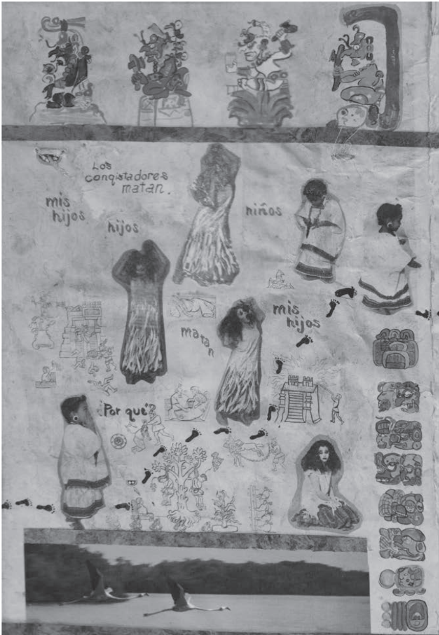
FIGURE 2. Panel 2 depicting Lloro-Lloro-Malinche from Codex Delilah . Copyright 2016 Delilah Montoya.