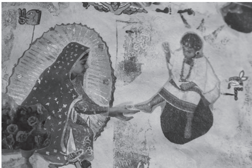
FIGURE 3. Detail from Panel 3 depicting Six-Deer and Lupe-Lupita, Codex Delilah . Copyright 2016 Delilah Montoya.

Montoya’s reliance on indigenous epistemologies, forms, texts, and images appropriate indigenous tradition, and by doing so, reassert these epistemologies as valid, while also making connections between Chicana/o thinking and its indigenous roots. The inclusion of important female figures reveals a collective female memory of the conquest and its horrors. Further, the final panel of the codex references the